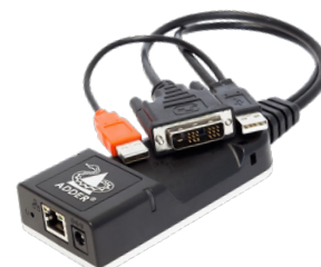
ADDERLink INFINITY 100T - DVI