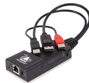
ADDERLink INFINITY 100T - DisplayPort™