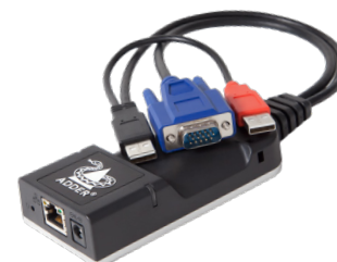
ADDERLink INFINITY 100T - VGA