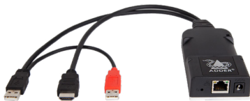
ADDERLink INFINITY 101T - HDMI