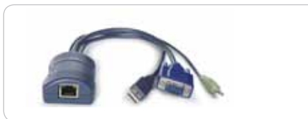
Example CAM: CATX-USB-A

Master Power Switch for connection to AdderView CATx IP or standalone Ethernet operation: PSU-8MASTER