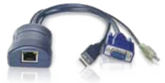
Example CAM: CATX-USB

CATX-PS2 (PS/2 only) CATX-USB (USB only) CATX-SUNA (Sun plus audio) X200 (console extension)